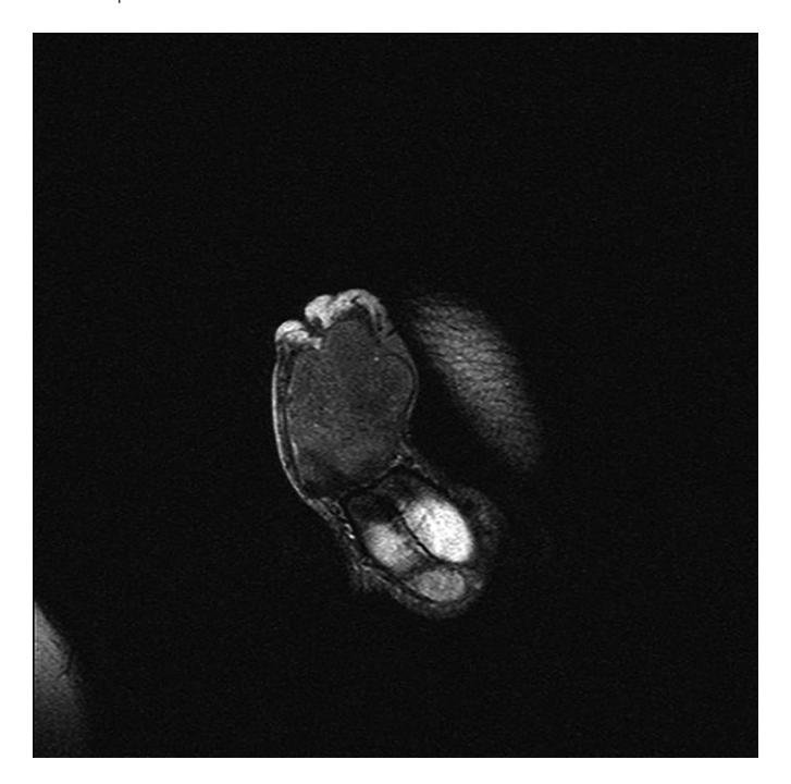
Fig. 3 Post-contrast T1 sagittal MRI showing tumour involving the glans and distal corpora. Tumour abuts the urethra and radioligical concern for early T3 disease was reported. Surgery confirmed T2b disease with no urethral infiltration.

Fig. 2 T2-weighted thin slice coronal MRI showing a large glans tumour. The TA was seen to be intact (arrow). Radiologically this was reported as T2a but pathologically there was microscopic lymphovascular spread through the TA into the distal corpora bilaterally consistent with microscopic T2b disease.